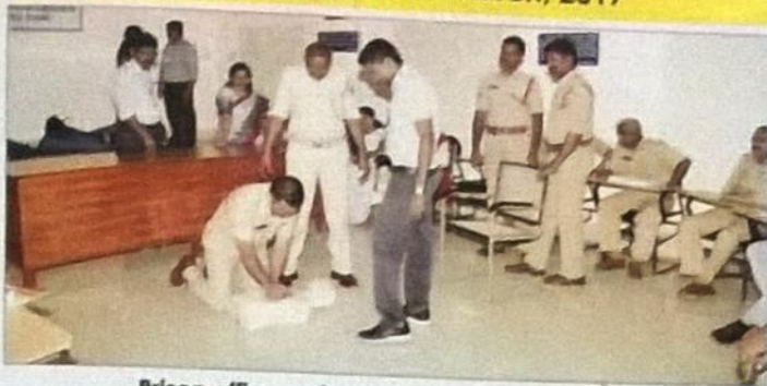
Prison officers given practical training on CPR Technique by CMC Doctors